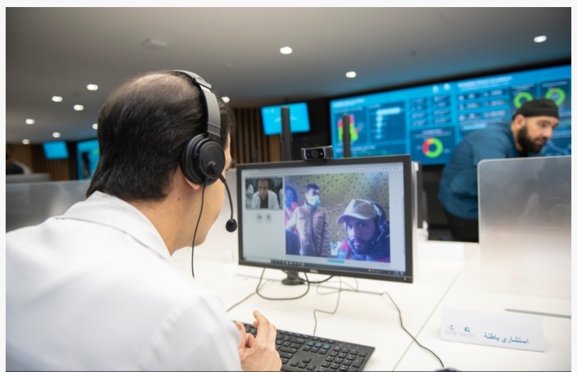
SEHA Virtual Hospital Telemedicine