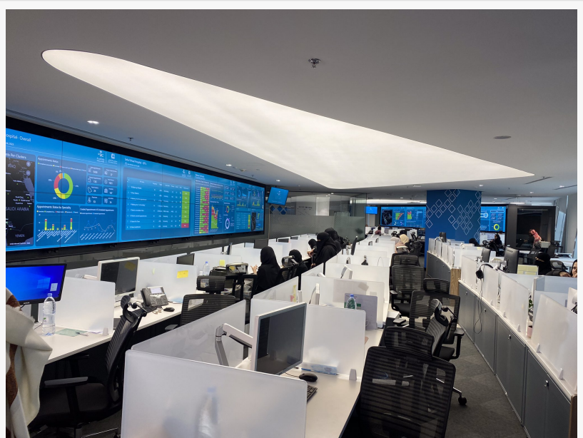
SEHA Virtual Hospital Telemedicine Control Centre

This press release can be viewed online at: https://www.einpresswire.com/article/617393859