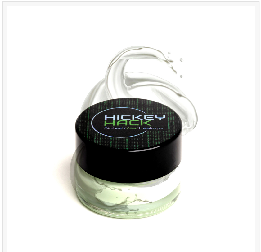
Hickey Hack Color Correcting Concealer: The Instant Hickey Solutions

This is an urgent request, with the National Hickey Day anthem needing to be released on February 19th, which is just a few days away. Hickey Hack is inviting any interested musicians or groups to reach out to them as soon as possible. The ideal candidate should be able to create an original, catchy, and upbeat anthem, and be willing to work with Hickey Hack on promotional efforts. It is also important that they can meet the tight deadline and be willing to be featured in