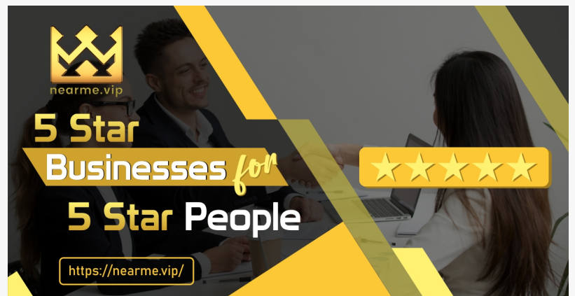
5 Star Businesses for 5 Star People