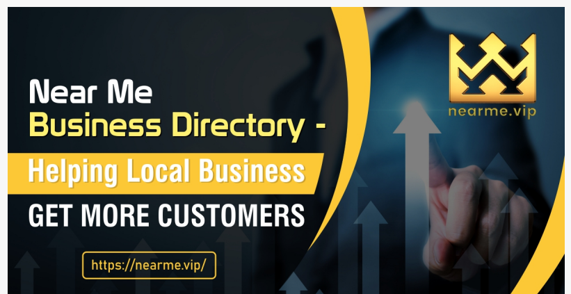
Near Me Business Directory - Helping Local Business Get More Customers