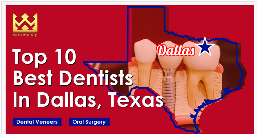
Top 10 Best Dentists in Dallas, Texas

Professional senior dentists make up the staff members here at Dallas Laser Dentistry. They are here to assist patients in obtaining wonderful and