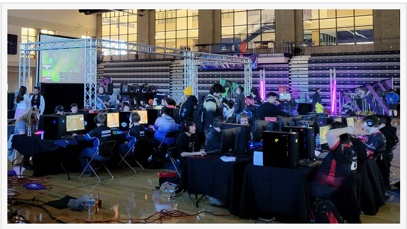
Esports athletes compete on the basketball court inside Illinois College's Bruner Fitness and Rec Center.

The spring season kicked off on February 11th and 12th with Gaming Fanfest Illinois College in Jacksonville, IL, and the next event is coming to Purdue Northwest in Westville, IN this March 4-5th. The grand finals event, featuring the League of Legends conference top four matches and the Valorant Unified Collegiate Gauntlet finals, will be held live on March 25-26th in Wichita, KS with a fully-