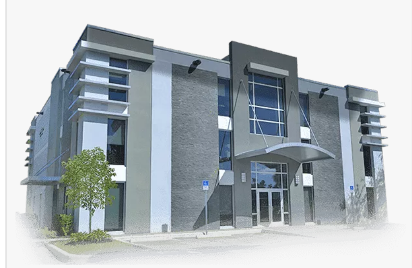
The Law Offices of Anidjar & Levine

This press release can be viewed online at: https://www.einpresswire.com/article/617631434