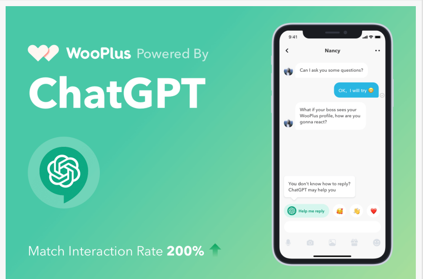
WooPlus Integrated ChatGPT

@Kylieeeee98: Love it! I always have difficulties coming up with funny lines