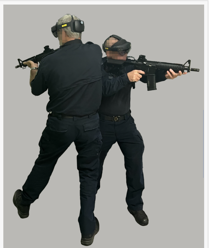
SWATS AUGMENTED REALITY

Military and security professionals rarely work alone in the real world, S.W.A.T.S allows up to 19 trainees to train simultaneously interacting with other users and AI in the session. Supervisors can be assigned to teams by the Supervisor with each team being allocated a specific role e.g., Blue Force, Red Force or Civilian.