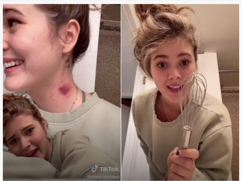
Tik Tok Girl With Whisk and Hickey

DENVER, CO, UNITED STATES, February 19, 2023 /EINPresswire.com/ -- February 19th marks the first-ever National Hickey Day, a day dedicated to celebrating all forms of love and promoting equality. This national holiday has been recognized and proclaimed by the National Day Archives, signifying a significant step towards progress for human rights.