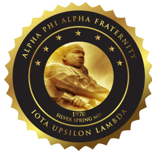
The Monument Chapter

Alpha Phi Alpha has been promoting scholarship and academic excellence since the fraternity's founding in 1906. A demonstrated community service leader for more than 50 years, the