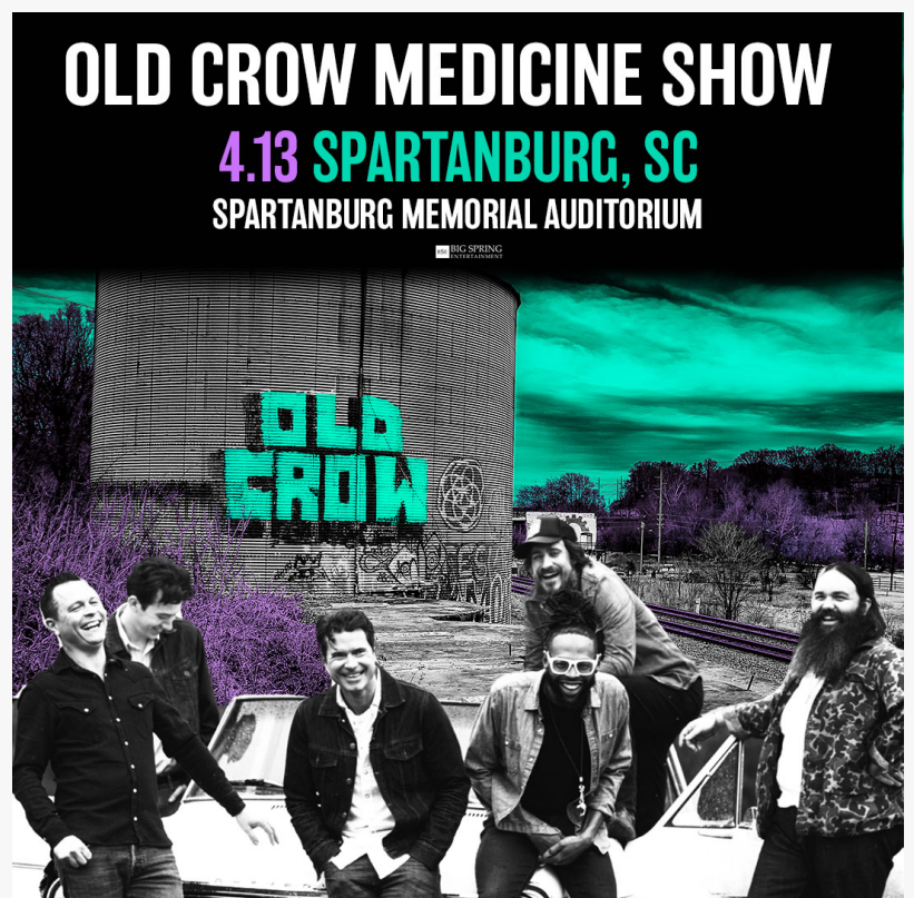
Old Crow Medicine Show Live at The Spartanburg Memorial Auditorium April 13, 2023

Old Crow Medicine Show, who solidified their status as one of country music's heavy hitters with hits like Wagon Wheel and Down Home Girl got their big break when they were discovered by folk country legend Doc Watson while busking on a corner in Boone NC. "That gig changed our