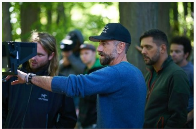
Director J.B. Sugar

No Equal Entertainment was founded in 1998 and is owned and operated by J.B. Sugar. Based in Canada, No Equal develops, produces, and distributes feature films, television movies, television series, and mini-series for the domestic and international marketplace.