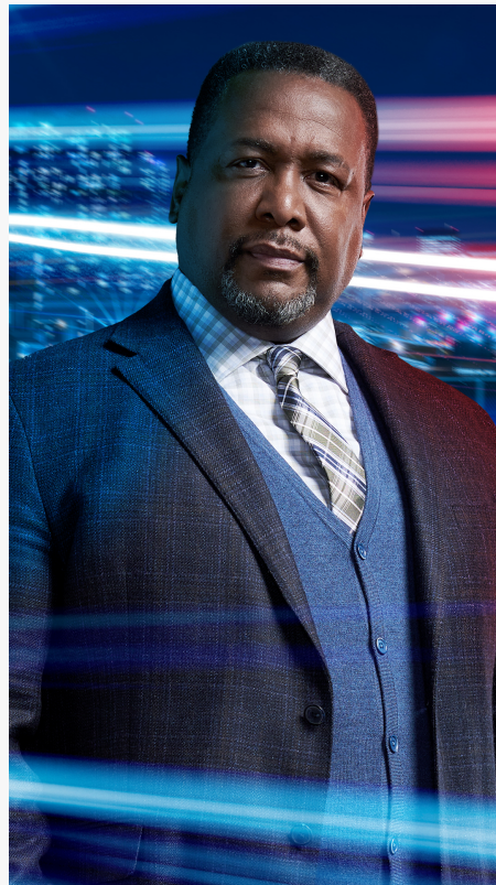
Wendell Pierce