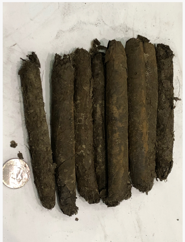
Seven Cuban cigars from the 1857 shipwreck of the S.S. Central America are shown next to a modern U.S. five-cent denomination coin for size comparison. Thirty-seven recovered Cuban cigars will be offered in auctions on March 4 and 5, 2023 by Holabird West

This press release can be viewed online at: https://www.einpresswire.com/article/618067612