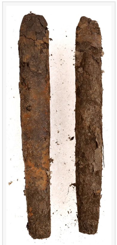
Two of the 37 Cuban cigars recovered from the 1857 sinking of the fabled "Ship of Gold," the S.S. Central America, that will be offered by Holabird Western Americana Collections in auctions on March 4 and 5, 2023.

Fred Holabird Holabird Western Americana Collections +1 775-851-1859 email us here