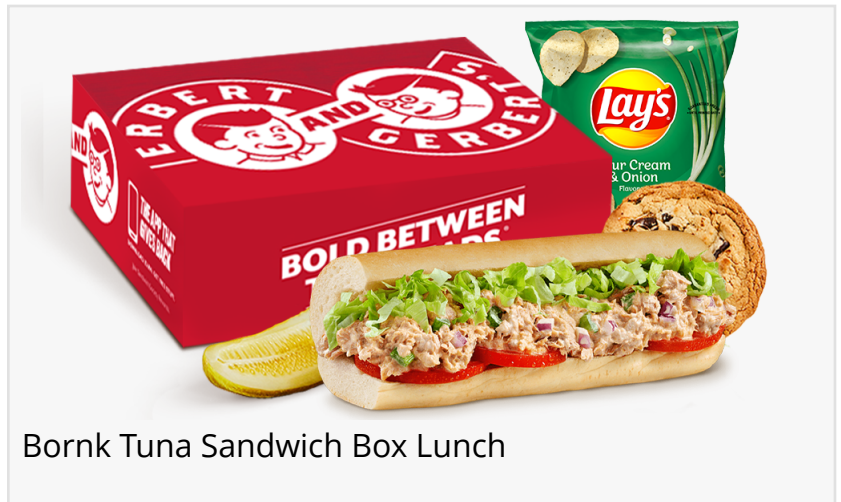
Bornk Tuna Sandwich Box Lunch

This press release can be viewed online at: https://www.einpresswire.com/article/618076805