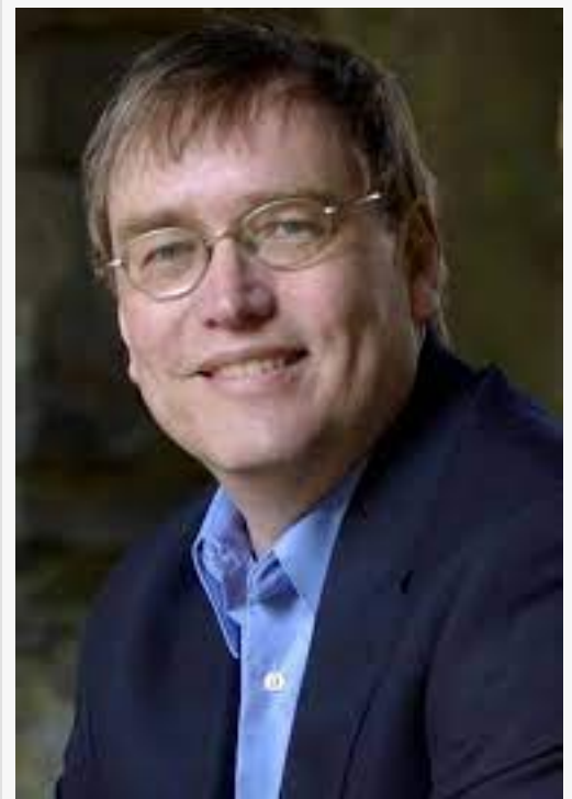
William R. Forstchen is widely considered one of the foremost experts on EMP attacks.

William R. Forstchen is a New York Times bestselling author and holds a doctoral degree from Purdue University with a specialization in military history and technology. He is a noted expert historian and public speaker and has been interviewed on FOX News, C-SPAN, and Coast to Coast on topics ranging from history to technology and cultural issues, to space technology development, to security threats.