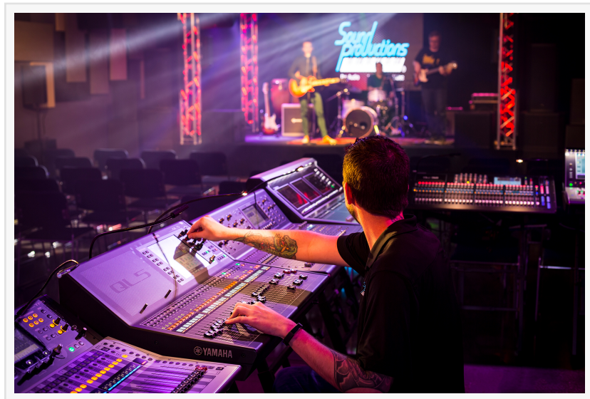
The SoundPro Experience Center - Sound Productions has been providing high-quality gear from the top brands for 50 years.

In the following decades, SoundPro expanded its services to fabricating custom electronic and speaker systems for touring bands, as well as custom-designed installs. When bands and production companies wanted to buy the products they rented, the transition to pro audio sales and repair was natural, and SoundPro started selling new and used gear all around the country. By 1985, the company shifted focus to sales and distribution. In 2012, SoundPro grew into a new location in Irving, TX. A second office in Madison,