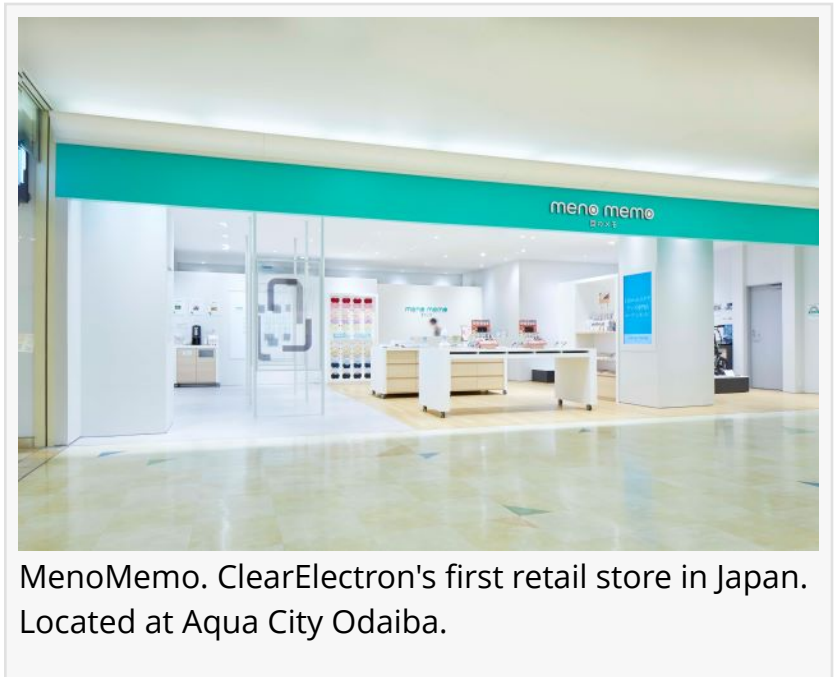
MenoMemo. ClearElectron's first retail store in Japan. Located at Aqua City Odaiba.

The HoldOn EyeCare Clip is available for purchase at ClearElectron's "MenoMemo" retail location in Japan, along with other items that promote excellent eye health. Even children's games that evaluate the health of their eyes are available in the store. In order to raise public knowledge of good eye health and a lifestyle that promotes good posture, ClearElectron is taking the world by storm and is now making the HoldOn EyeCare Clip available to everyone with their new global website. Their commitment to expanding their product line worldwide is just getting started. The HoldOn EyeCare Clip will be on display for the first time in the United States at Vision Expo East in New York from March 17-19, 2023, at stand #PAN 2144.