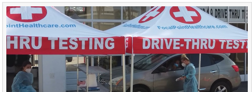
$LBTD Rapid Testing

Lotus Bio-Technology Development Corp. (OTC: LBTD) is committed to improving healthcare and advancing diagnostics through technology development and market acquisition. LBTD currently manages a portfolio of state-of-the-art technologies and innovative companies that are successfully modernizing medicine and prioritizing a user-friendly approach to patient care.