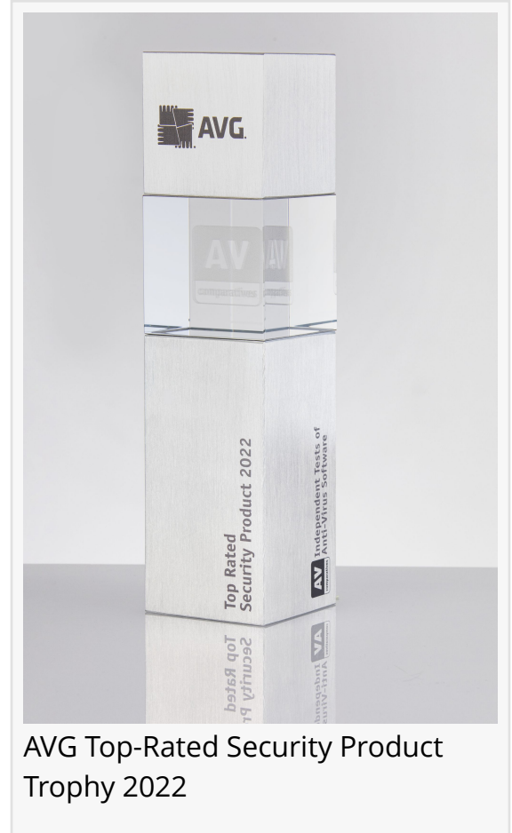
AVG Top-Rated Security Product Trophy 2022

product. An "Approved Product" award means that the software has been rigorously checked to