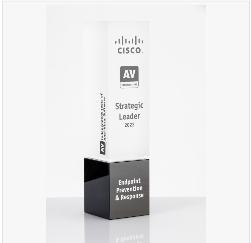
Cisco Strategic Leader EPR Trophy 2022

AV-Comparatives' tests are very carefully designed and executed to thoroughly and realistically simulate scenarios that face users in real life. Consequently, a certification by AV-Comparatives is a guarantee of an effective and reliable product. An "Approved Product" award means that the software has been rigorously checked to ensure that it will perform its intended task competently. It is an industry-recognised standard of quality.