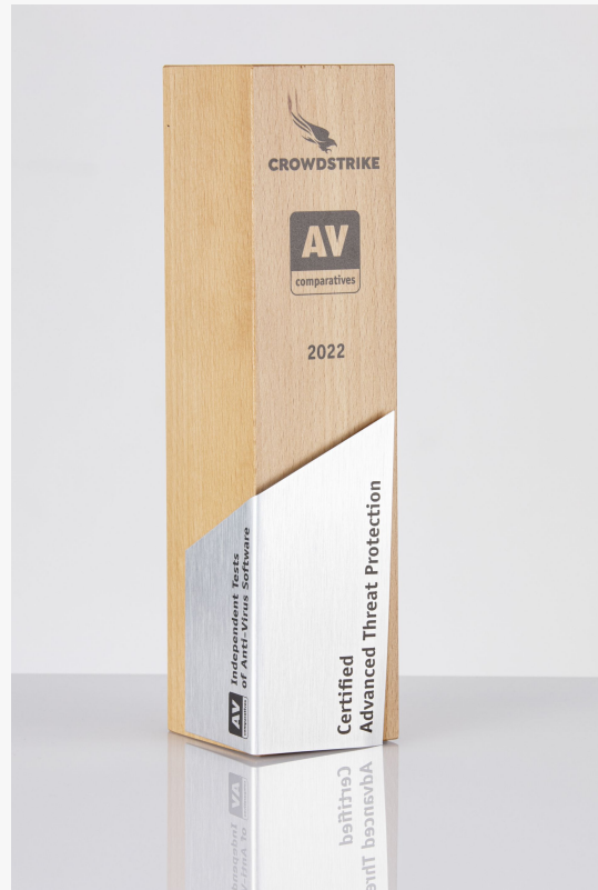
CrowdStrike Certified Advanced Threat Protection Trophy 2022