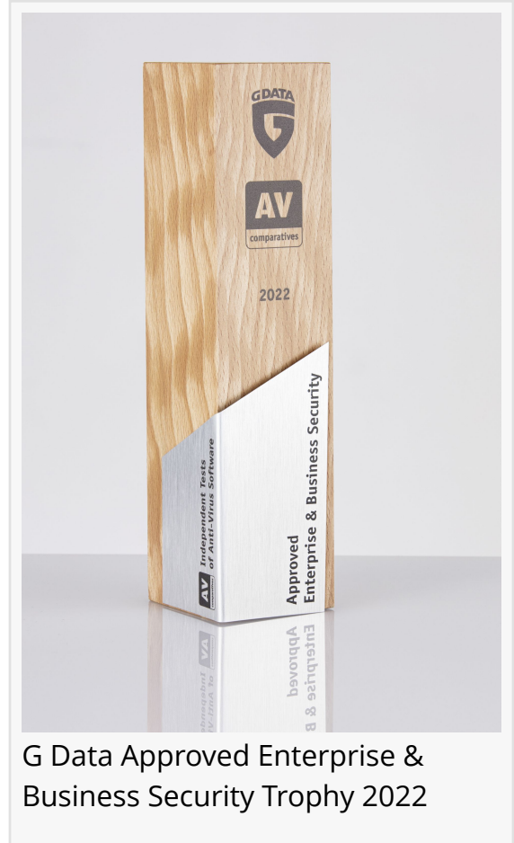
G Data Approved Enterprise & Business Security Trophy 2022

AV-Comparatives' tests have multiple aspects, to represent the different requirements of IT