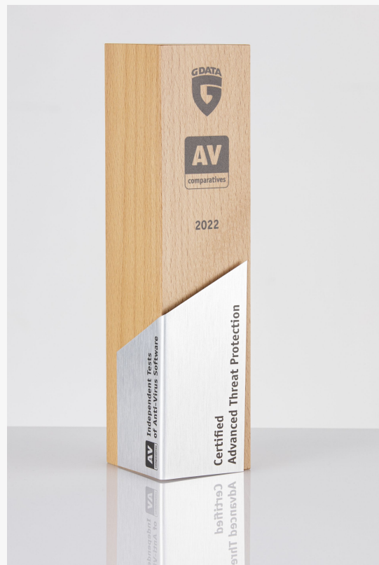
G Data Certified Advanced Threat Protection Trophy 2022

Finally, G Data received an Approved Mobile Security Product certification for its mobile software.