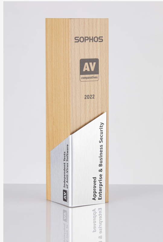
Sophos Approved Enterprise & Business Security Trophy 2022

AV-Comparatives' tests are very carefully designed and executed to thoroughly and realistically simulate scenarios that face users in real life. Consequently, a certification by AV-Comparatives is a guarantee of an effective and reliable product. An