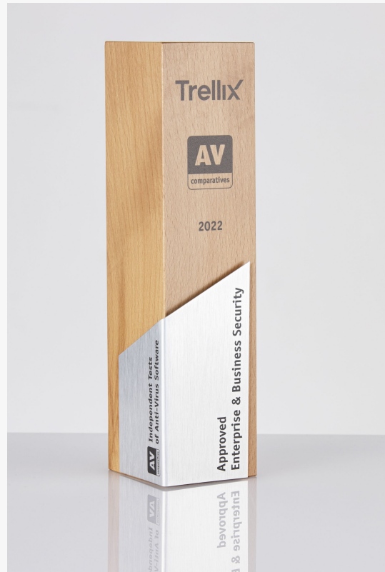
Trellix Approved Enterprise & Business Security Trophy 2022

AV-Comparatives' tests are very carefully designed and executed to thoroughly and realistically simulate scenarios that face users in real life. Consequently, a certification by AV-Comparatives is a guarantee of an