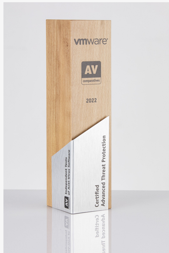
VMware Certified Advanced Threat Protection Trophy 2022