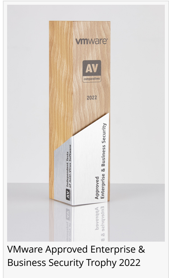
VMware Approved Enterprise & Business Security Trophy 2022

https://www.av-comparatives.org/av-comparatives-awards-2022-for-VMware/