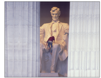
Sample page spread of mischief at the Lincoln Memorial

I captured this monumental mischief—if you will—one summer morning at dawn when I spotted this lad climbing up the statue and finally sitting on Abe's head. At the time there were no park rangers or U.S. Park Police officers there, so he got away with his dastardly deeds. But, alas, and unbeknownst to this rock climber, he has been immortalized on film forever. Is it a crime to climb on Lincoln? Yes, don't try it.