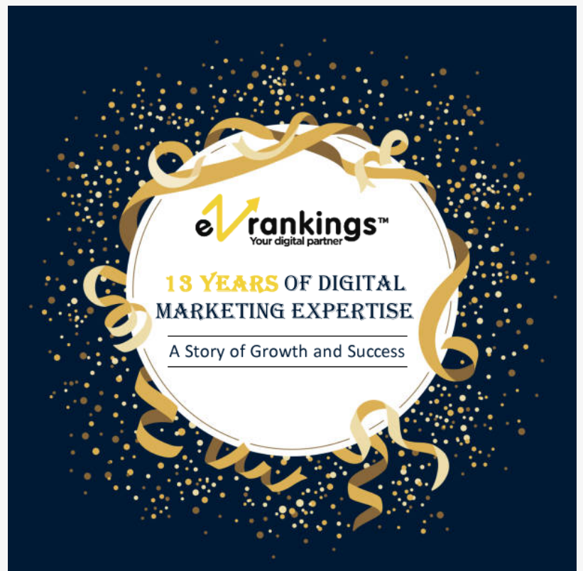
EZ Rankings' 13 Years of Digital Marketing Expertise

Today, EZ Rankings offers a wide range of digital marketing services, including SEO, social media marketing, pay-per-