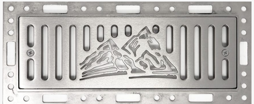
Ventiques metal vents