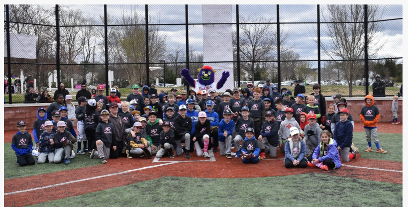
A one-day baseball camp held annually and provides an opportunity for children to play, build skills and meet friends

FREDERICKSBURG, VIRGINIA, USA, February 23, 2023 /EINPresswire.com/ -- The Karen Friedman Memorial Baseball Camp for a Cure (KFMBC) will be held Sunday, March 26, 2023, in Fredericksburg, Virginia, in honor of a wife, mother, teacher, friend, and inspiration to many. The one-day camp offers multiple skill training stations as