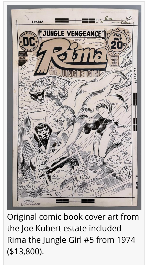
Original comic book cover art from the Joe Kubert estate included Rima the Jungle Girl #5 from 1974 ($13,800).

© 1995-2023 Newsmatics Inc. All Right Reserved.