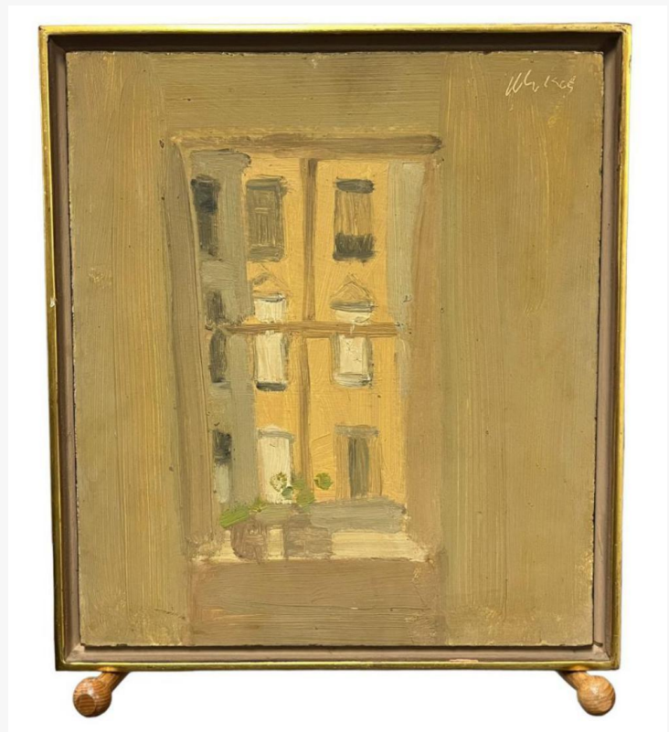
Oil on board painting by Alex Katz (b. 1927), titled Window #1 , 9 ½ inches by 11 inches, artist signed upper right and with a gallery label on back ($37,950).