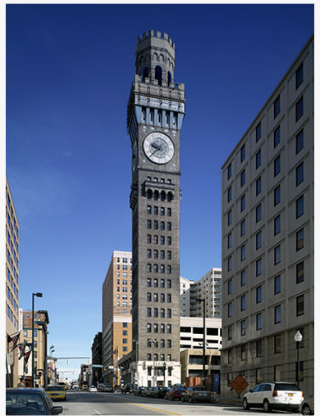
Bromo Seltzer Arts Tower

This press release can be viewed online at: https://www.einpresswire.com/article/618511660