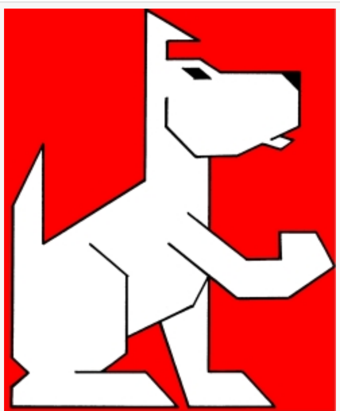
The logo of Small-Tooth-Dog Publishing Group

This press release can be viewed online at: https://www.einpresswire.com/article/618541503