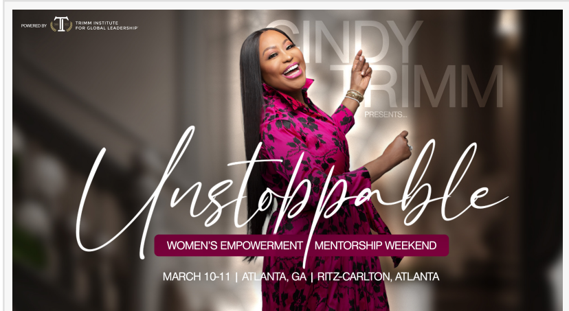
Unstoppable Women's Empowerment Mentorship Weekend

“This is very exciting time in history, and my goal is to continue this trend by helping women maximize their leadership and entrepreneurial potential by giving them the tools to rid themselves of self-imposed limitations, to show up unapologetically strong and own the spaces that they are in. The new normal has leveled the playing field for everyone. We have an amazing