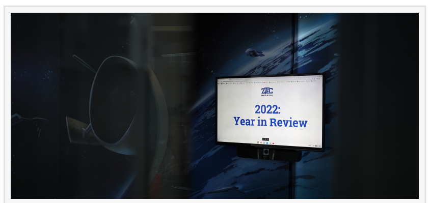
Zitec | 2022 Business Performance, Client Service Excellence, Investment in People, Culture, and Products

BUCHAREST, ROMANIA, February 24, 2023 /EINPresswire.com/ -- Zitec, a European tech company headquartered in Romania, recorded a turnover of €25.2 million in 2022, an increase of 42% compared to the previous year. With a customer retention rate of 82% and an employee loyalty rate of 85%, the company