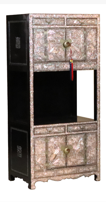
Korean Najeonchilgi Emperor's chest. (est. $4,000-$6,000)

John Henry Belter. There are a couple additional pieces of highly ornate Victorian furniture, including a marble-top center table and shield-decorated piano stool.