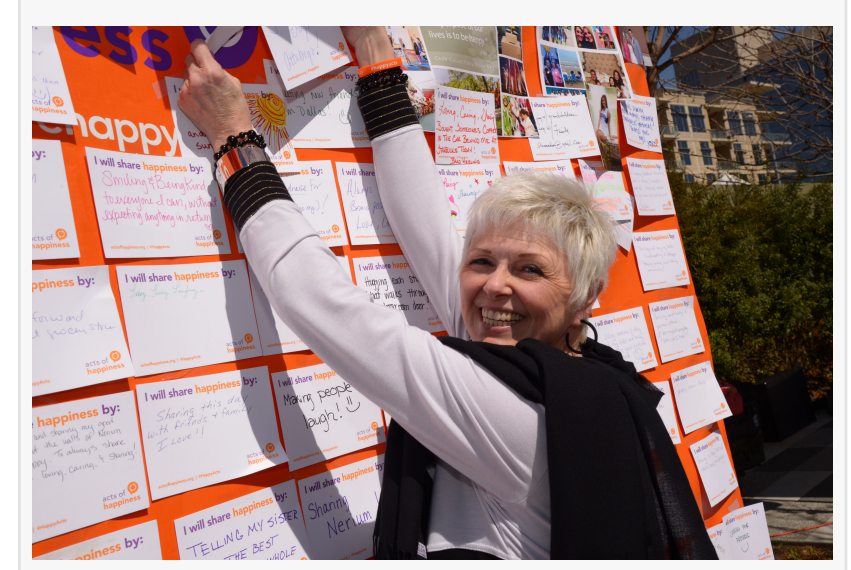
Schools and businesses are encouraged to create Happiness Walls

Live Happy has created a month-long calendar of activities to share #HappyActs