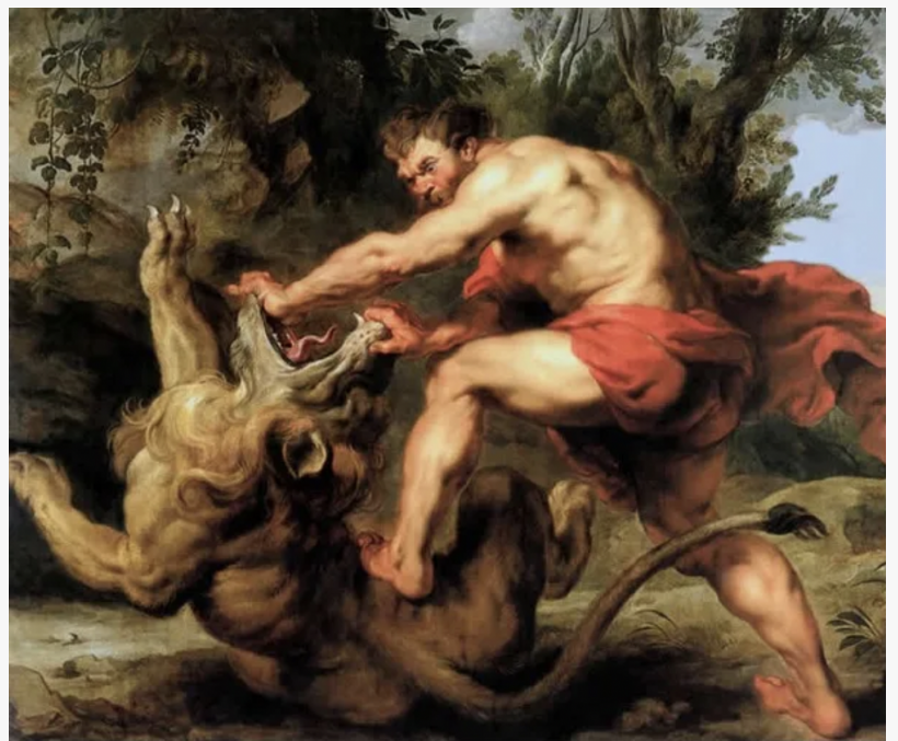
Peter Paul Rubens

I imagined Delilah, armed with nothing more than her exquisite beauty and cunning deceit, enticing the lustful Samson, by pushing him beyond the normal boundaries of love making. Why else would the Nazarite give up the key to his great strength, unless lured by forbidden, erotic desires?