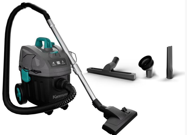
Kenmore® All-Purpose Wet / Dry Canister Vacuum KW3050