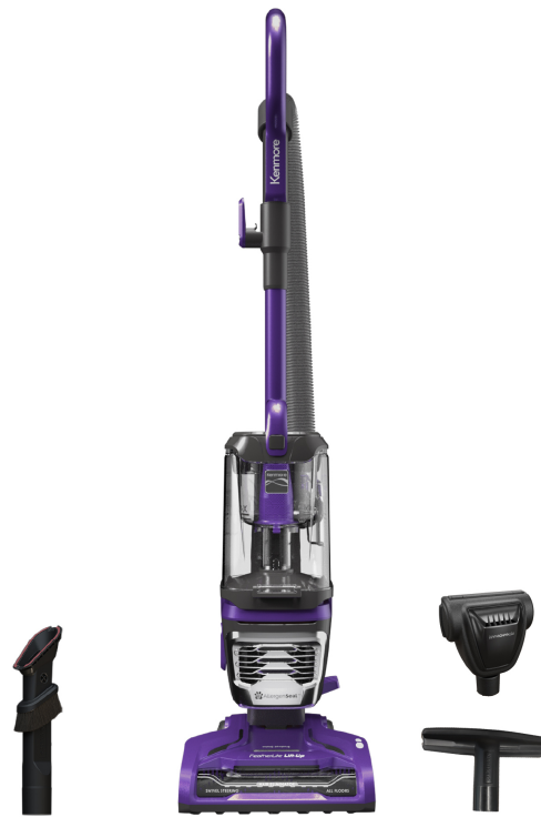
Kenmore® FeatherLite™ Lift-Up® Bagless Upright Vacuum with Hair Eliminator® Brushroll DU4099

This Kenmore bagless upright with completely sealed air path can tackle all cleaning needs. Quickly transition to lightweight cleaning with Lift-Up® for stairs and floor cleaning. The AllergenSeal™† system traps 99.97% of dust down to 0.3 microns. The Hair Eliminator® feature keeps pet hair off the brushroll for less maintenance. At under 12lbs, this full-featured upright maneuvers around furniture with swivel steering and includes a LED headlight with 7ft of above the floor