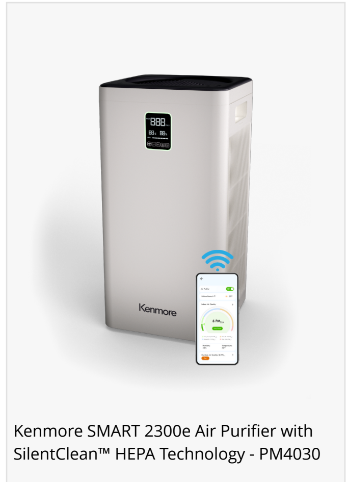
Kenmore SMART 2300e Air Purifier with SilentClean™ HEPA Technology - PM4030

Effortlessly purify up to 2,300 square feet with super low energy consumption, based on one air change per hour. Say goodbye to unwanted odors, dander, and more as the HEPA filter captures 99.97% of dust particles down to 0.3 microns†.