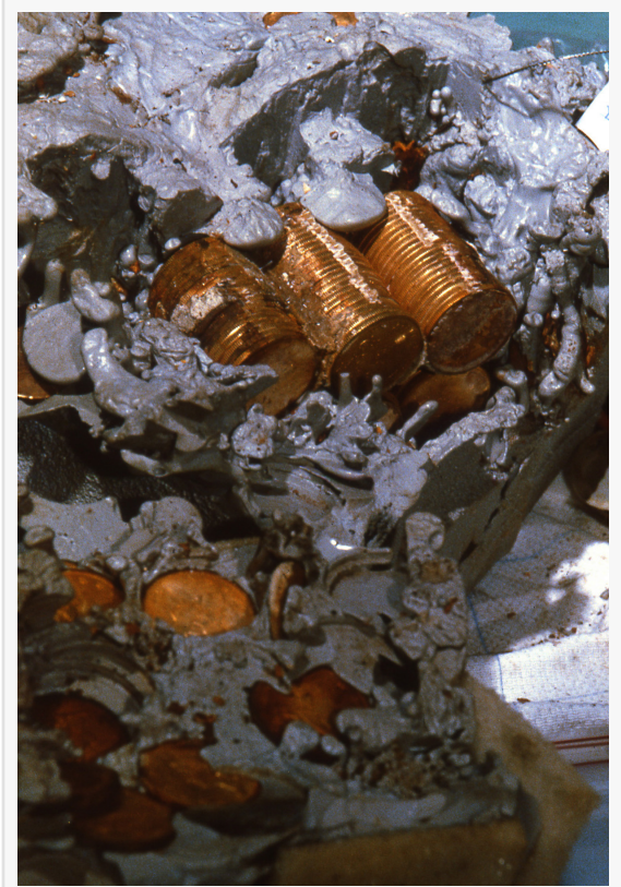
Some of the gold coins after their recovery from the S. S. Central America and prior to expert conservation to remove calcium carbonate ocean residue to reveal their brilliant, mint state condition.

Holabird Western Americana Collections, LLC has prepared an extensive catalog with many illustrations of the S.S. Central America recovery operations in 3-D. Copies of the March 2023 auction catalog are available for $100 each with the price refundable with any purchase from the