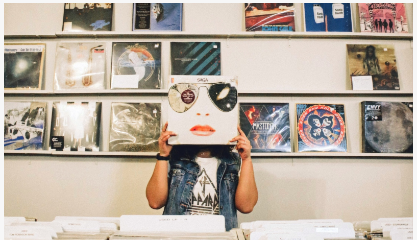
Is Analog Music Dead?