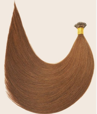
hair extension wholesale