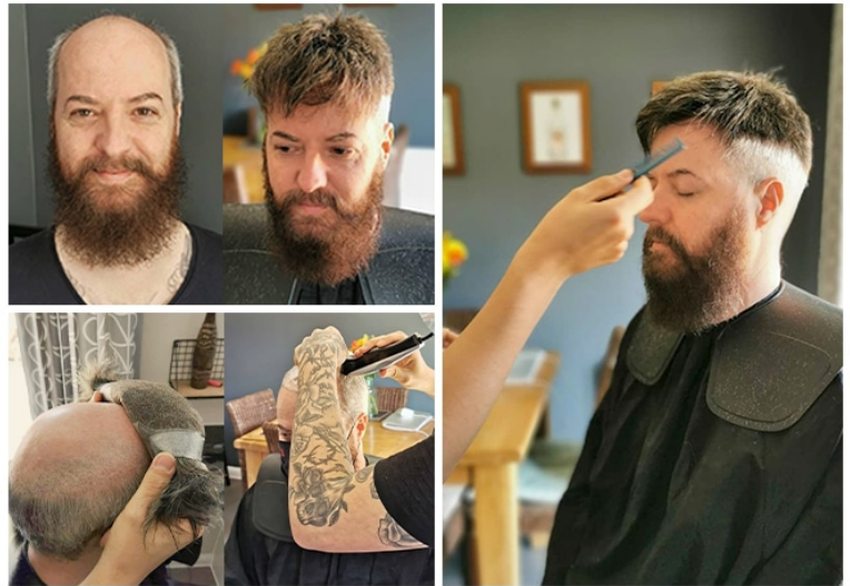
hair system transformation

The trade fair is fast approaching. New Times Hair is ready to bring on board new designs and recommendations for their products or business operations from all visitors around the world!