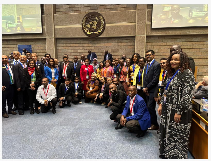
Lions from 10 States, 4 continents, and 7 countries who joined the first ever Global Service week in Nairobi, Kenya (February 9, 2023).

The Congress for Global Communications exists to promote diverse and inclusive dialogue resulting in civility for all. Its purpose is to 1) encourage dialogue; 2) impact humanity through