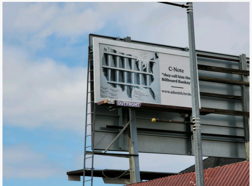
Incarceration Nation Artist's Billboard Exhibition