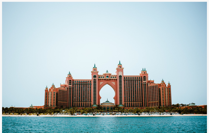
Here you see The Palm Jumeirah & Atlantis Hotel on Dubai's Palm Island, this is the pride of the United Arab Emirates, as the island was artificially created and shows what humanity is capable of.