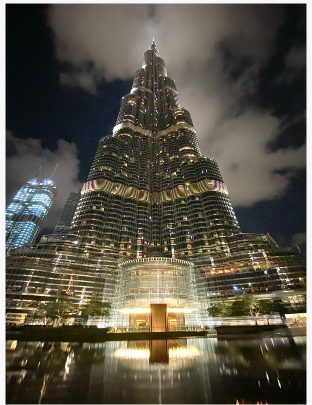
Dubai needs no introduction, being one of the most renowned cities in the United Arab Emirates. Its reputation for opulence and affluence is well-earned, boasting iconic structures like the Burj Khalifa.