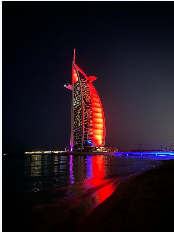
The Burj Al Arab, the world's only seven-star hotel, is largely responsible for the emirate of Dubai's recent rise to prominence as a tourist destination.

provides a distinctive fusion of contemporary and heritage. Organizations throughout the world have praised the country's approach to countering extremism and terrorism, and its strides