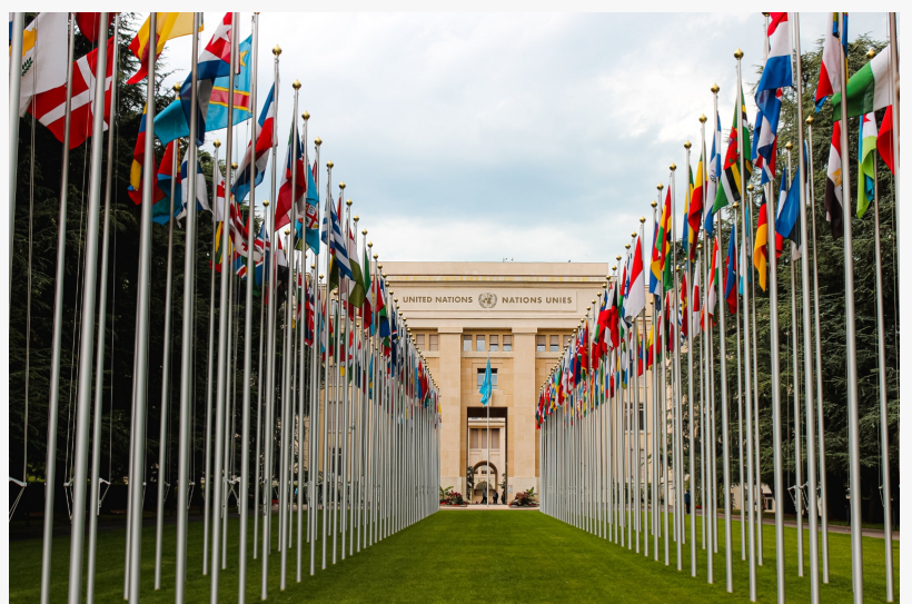
On February 21, 2023, from 4-6 pm Geneva Time, the 43rd UPR session held a high-level panel discussion for experts and professionals.