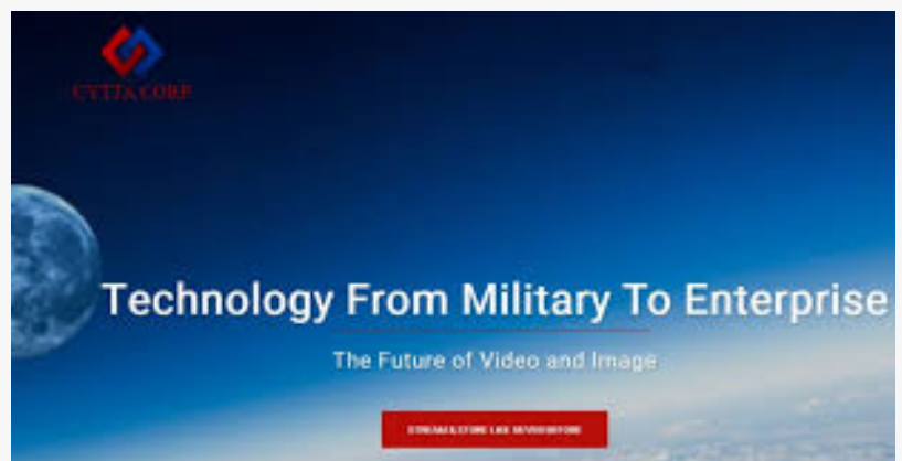
CYCA Military to Enterprise