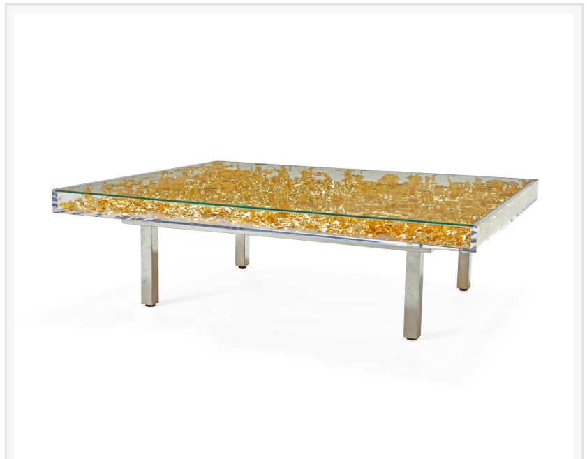
Yves Klein, (1928-1962), "Table Monogold," designed 1961/1963, Gold leaf, glass, Plexiglass, wood, and steel, 14.25" H x 49.25" W x 39.25" D