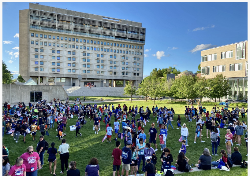
Students taking part in the memento exchange at IC 2022