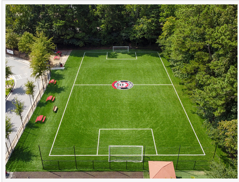
Artificial Grass on playing field

About Southern Turf Co. Southern Turf Co. is owned by three dads, each with three young kids, who saw the value and enjoyment that turf brought to their own homes. The highly-experienced Southern Turf Co. team focuses on delivering quality workmanship at a competitive price while providing a personalized and enjoyable experience throughout the