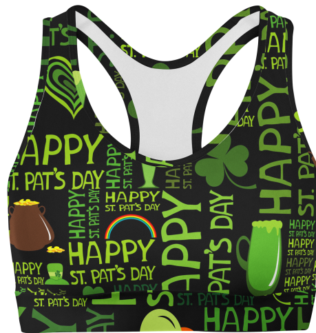
Happy St Patrick's Day Sports Bra from Happybeingwell.com

This press release can be viewed online at: https://www.einpresswire.com/article/619325861