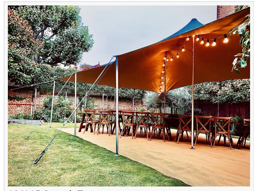
10 X 15 Stretch Tent

Timothy Maysh Féte24 +33 7 66 43 02 11 email us here Visit us on social media: Facebook Twitter Instagram YouTube