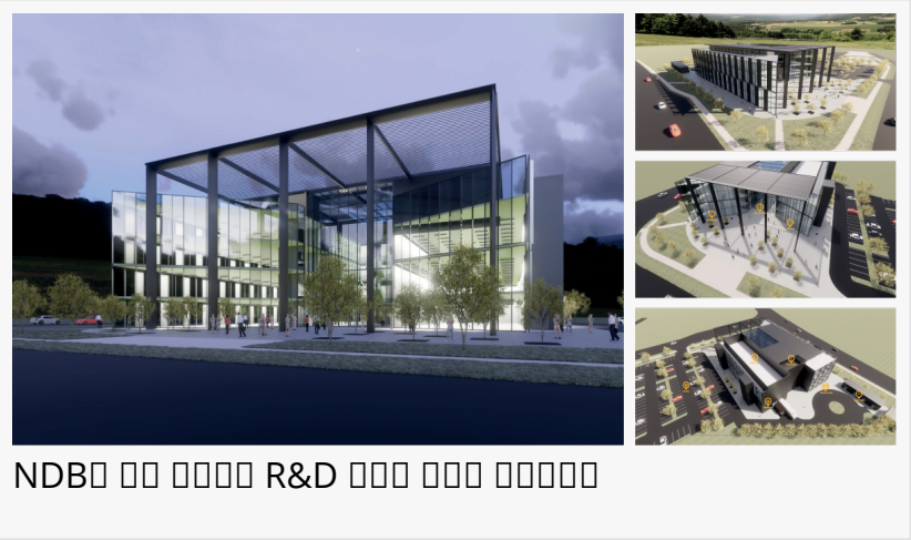
NDB R&D building

Regulation CF 500K USD. The company is currently raising capital through a crowdfunding campaign on the PicMiiCrowdfunding platform.